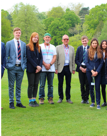
Plastic Free Eastbourne Talk