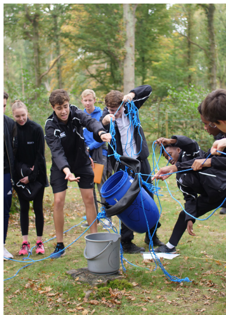
Lower Sixth Team Building Day