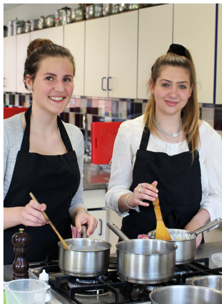
Sixth Form Futures Week