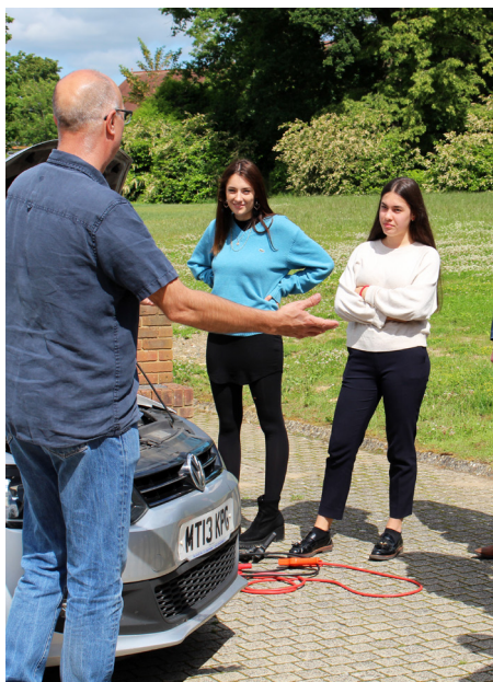
Futures Week Workshop